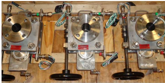
TMC SLIDE TYPE LINE BLINDS WITH POSITION INDICATING SWITCHES