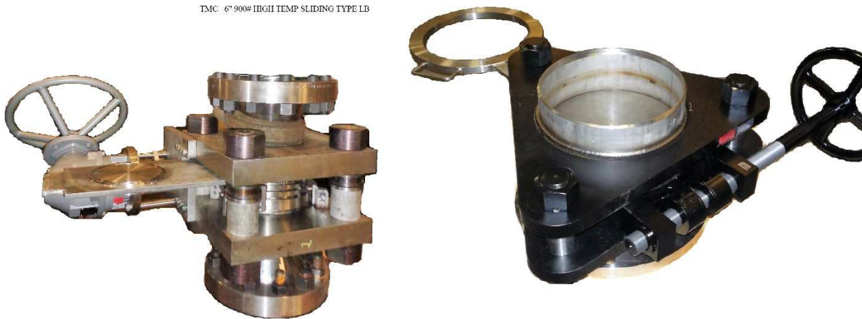
TMC 6" 900# HIGH TEMP SLIDING TYPE LB

TRETTER MANUFACTURING COMPANY WWW.TMCVALVES.COM